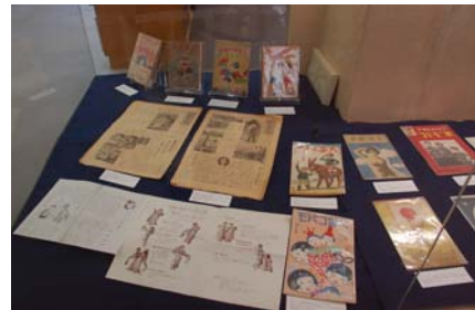
"From Osaka! Children's Culture No.3: The Media and Child's Culture"