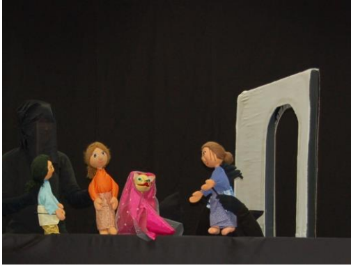
By Puppet Play Circle Palette