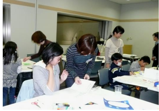
Making a Picture Book Workshop