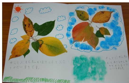
A child's picture book page