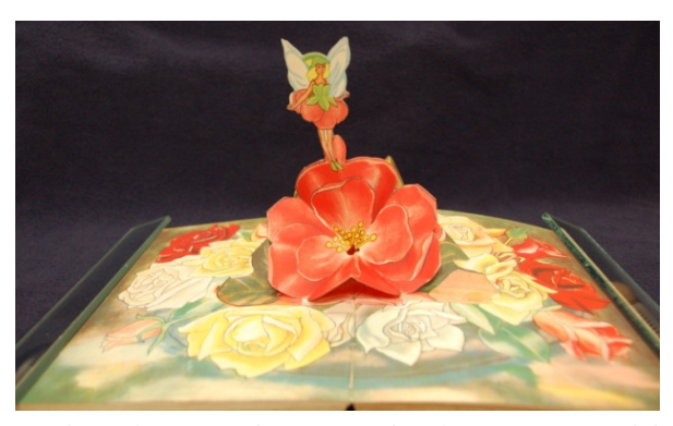
Bookano Stories with Pictures that Spring up in Model Form. No.10 , Edited & Produced by S.Louis Giraud, London: Strand Publications, 1943.